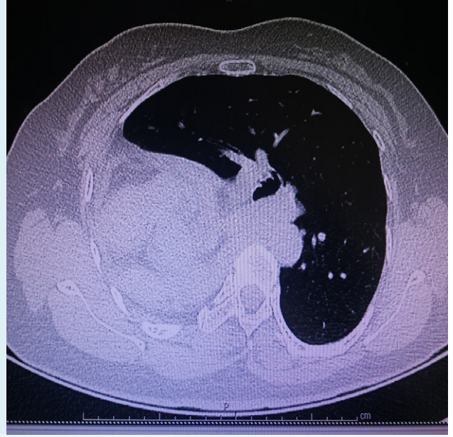
CT = computed tomography