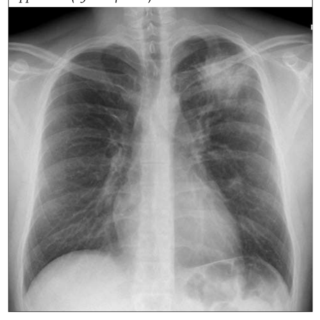
Figure 1. Chest X-ray showing a consolidation in the left upper lobe (232 \times 241 \text{ mm})

a consolidation in the left upper lobe (figure 1). Under the diagnosis of pneumonia caused by Streptococcus pneumoniae or an atypical pathogen, he was treated with moxifloxacin. Nevertheless symptoms persisted and the patient was hospitalised for further diagnostics and treatment. A new chest X-ray showed subtle infiltrative lesions in the right lung as well. Intravenous Cefuroxime was added. Because of positive Chlamydia serology, moxifloxacin was changed for doxycycline, but only after a diagnostic bronchoscopy with bronchoalveolar lavage (BAL) was done. A tuberculin skin test was negative. Because of persisting fever, prednisone was prescribed and the patient could be discharged on doxycycline and