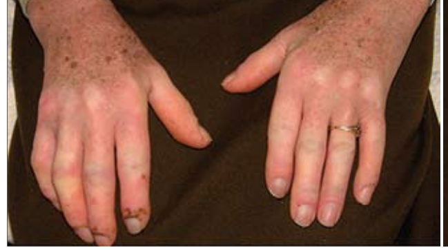
Figure 1. Patient's hands