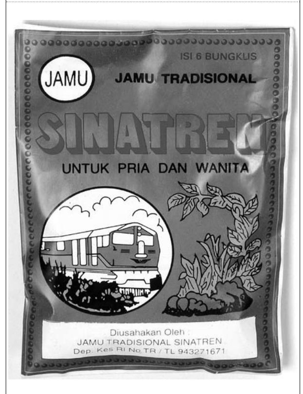
Figure 2. Sachets of Sinatren® (see text for details)

There were no signs of oedema. She was admitted to the hospital for clinical testing and analysis of her low back pain. Cortisol and ACTH values were 0.33 µmol/l and 14 ng/l respectively (9.00 am). Other laboratory values were as follows: creatinine 52 µmol/l, sodium 134, and potassium 3.6. Repeatedly measured cortisol values between 8.00 and 9.00 am were low (cortisol 0.22 and 0.29 \mu mol/l). In combination with the clinical presentation we assumed that she had signs of a relative adrenal insufficiency and therefore a synacthen test was not performed. Substitution therapy with hydrocortisone was started (10-5 mg). An X-ray of the lumbar spine was taken, revealing loss of height of several corpora (Thii, Thi2, Li, and L2) and secondary thoracolumbar kyphosis. Bone densitometry showed low values of the bone mineral density for the lumbar region (T score -3.8, Z score -1.7) and both colla (T score -3.3, Z score −1.6) indicating osteoporosis. After a few days of bed rest and medication for the low back pain, she was able to resume daily activities again. She was also being treated with bisphosphonates and calcium supplements. At that time, the results of the Sinatren® analysis by our hospital pharmacy department became known. High-performance liquid chromatography (HPLC) revealed the presence of dexamethasone and acetaminophen (figure 3).