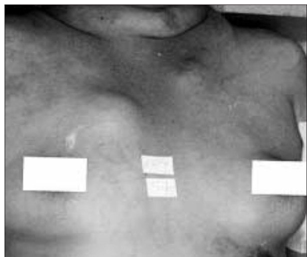
Figure 1 Widespread blue-coloured, soft cutaneous lesions on the trunk and neck

A 33-year-old woman was admitted to the intensive care unit with renal failure and severe anaemia. She had widespread blue-coloured lesions, which she had first noticed on her neck at the age of 13. She did not seek medical help for these lesions. She had two uneventful births and her children were healthy. There was no family history of similar lesions. Physical examination revealed a body temperature of 36°C, pulse rate 120 beats/min and regular, respiration rate 24/min and blood pressure 80/50 mmHg, supine. Her general condition was poor; she was pale and had multiple blue-coloured, soft, nodular lesions, ranging from 3 to 80 mm in size throughout her body ( figure 1 ). Two soft painless masses