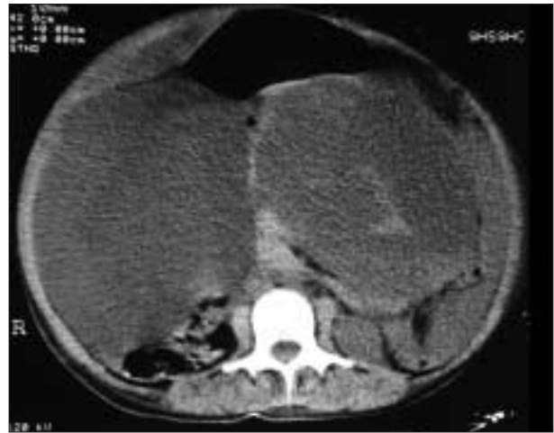
Figure 2 The abdominal CT of the patient, which was performed on the first day of hospitalisation, revealed two large cystic masses in the abdominal cavity

Necropsy was performed and macroscopic evaluation revealed extensive blue-coloured masses on her face, neck, chest, abdominal wall, major and minor labium, and limbs. Similar lesions were also observed on the pericardium, liver, renal hilus and bladder. Microscopically, these lesions were composed of large, blood-filled spaces with a thin endothelial lining and were consistent with cavernous haemangiomas. There were two cystic lesions measuring 25 and 35 cm in diameter in the abdomen, one filled with blood and the other with serous fluid (figure 3). Microscopic examination of these lesions, which were lined by attenuated endothelium, disclosed lymphangioma and there were small lymphoid aggregates in the stroma (figure 4). The gastrointestinal tract was examined carefully but no similar lesions were found. There were no pathological findings in any other organs such as brain, lungs, heart and spleen.