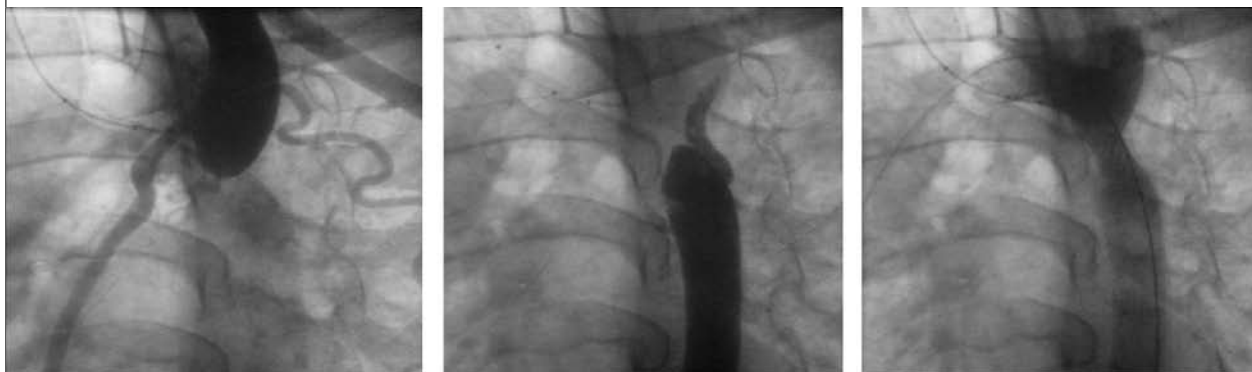
Figure 1. Antegrade (left panel) and retrograde (middle panel) angiography of the thoracic aorta was necessary due to the pinpoint stenosis of the severe aortic coarctation, right panel shows the aorta after expandable stent placement

In the general population, only 5% of patients with hypertension have an underlying disorder causing the hypertension. The younger the patient, the higher the chance of secondary hypertension. Of all causes of secondary hypertension, the prevalence of coarctation of the aorta in adult patients in the primary care setting is probably less than 0.2%. 3