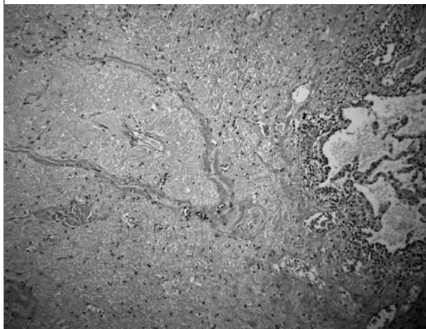
Figure 2. Lung tissue infarcted on the left side, vital tissue on the right side (H&E staining)