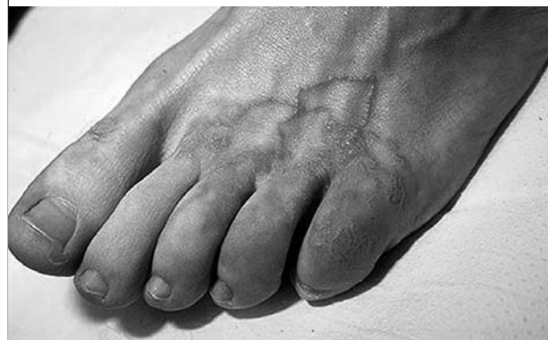
Figure 2. Illustration of typical cutaneous larva migrans

In summary HCLM is easily recognised if it occurs in its typical clinical form of creeping dermatitis. Hookworm folliculitis, however, is a less common clinical presentation of the same parasitic infection. Persistent itching folliculitis in a patient who has recently returned from an area where hookworm infestation is endemic should raise the suspicion of atypical hookworm folliculitis. Histological confirmation is required to make a definite diagnosis of a hookworm folliculitis in the absence of the characteristic creeping eruption. Treatment should be started based on typical clinical findings. A single oral dose of ivermectin or a three-day course of albendazole suffices as treatment in most cases. 9