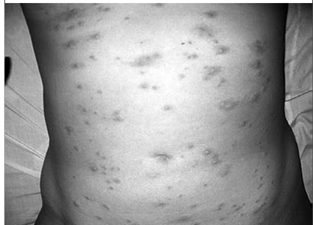
Figure 1. This figure shows the abdomen of our patient approximately two weeks after the infection at the beach

increasingly itchy. She had no medical or dermatological history and was not taking any medications. Her partner was unaffected. She visited a local medical institution for her symptoms and was treated with antibiotics (amoxicillin/clavulanic acid) and an H1-receptor blocker without effect. Four weeks later, after returning to the Netherlands, she was seen by her general practitioner (GP) because of persisting itchy abdominal and submammary erythematous papules, with purpuric lesions ( figure 1 ). As the GP suspected scabies, he treated her with lindane, but without success. The patient was therefore referred to a dermatologist. Laboratory investigations at that time revealed a leucocyte count of 15.2 \times 10^9/l (reference value 4.3-10.0), eosinophils 44% (0-5%), Hb 8.3 mmol/l (7.5-10.0), aspartate transaminase 43 IU/l ( <31 IU/l), alanine aminotransferase ( <31 IU/l) and IgE titre 169 kU/l ( <100 kU/l). Her faeces were tested for parasites, which revealed a hookworm infection.