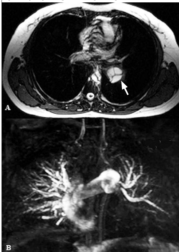
Figure 1: A. Chest MRI scan showing septated cystic lesions (white arrow) in the left main pulmonary artery. B. MRI angiography showing total occlusion of the left inferior pulmonary artery.