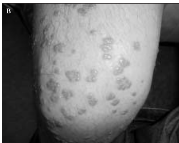
Figure 2 Eruptive xanthomas found on the upper legs (A) and knees (B) of a patient with severe hypertriglyceridaemia (fasting TG = 46 mmol/l)