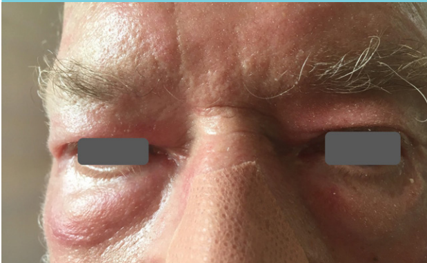
Figure 1. Periorbital erythema with oedema