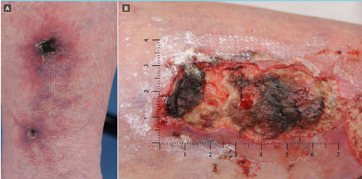
Figure 1. A. Two necrotic lesions surrounded by livedoid reticularis on the lower right leg. B. Large ulcerated lesion on the right lower leg a few weeks after initial presentation

abnormalities, and a biopsy was taken. Differential diagnoses included polyarteritis nodosa, cholesterol embolisation, and calciphylaxis. Topical corticosteroid therapy and pain management were pragmatically started. Unfortunately, the biopsy was inconclusive. Meanwhile, the symptoms worsened, but the patient did not agree to a new biopsy. Oral prednisone was started, with vasculitis/polyarteritis nodosa as the main working diagnosis. A wound culture did not reveal any non-physiological flora. The symptoms continued to worsen ( figure 1b ) and a few months later the patient agreed to a new biopsy. This time the biopsy demonstrated a clear image of calciphylaxis ( figure 2 ). Further laboratory evaluation showed a normal serum calcium of 2.32 mmol/l (2.10-2.55 mmol/l), a normal phosphate level of 1.04 mmol/l (0.80-1.50), a mildly increased parathyroid hormone of 10.0 pmol/l (1.6-6.9 pmol/l), and decreased vitamin D (25-OH) of 17 nmol/l (> 50 nmol/l). Creatinine level was 119 \mu mol/l and the MDRD was 38 ml/min. Subsequently, supplementation of vitamin D was started, and the hyperparathyroidism was corrected by prescribing cinacalcet (mimpara). Simultaneously, acenocoumarol was replaced by a low-molecular-weight heparin (LMWH). Unfortunately, two weeks later our patient died, with cardiac failure being the most presumable cause in a multifactorial situation. No autopsy was allowed.