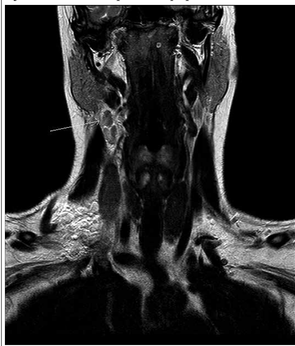
Figure 1. MRI showing jugular vein thrombosis with fat infiltration and multiple small lymphatic nodules