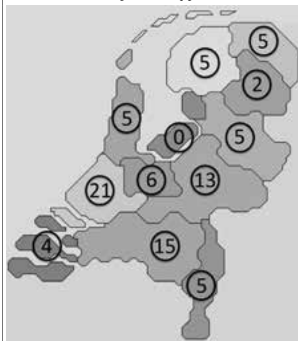
Figure 1. The distribution of the 86 respondents to the Internet survey about the bites of exotic venomous snakes in the Netherlands, represented by province

hobby for less than five years, whilst 12 of them (14.0%) had been doing so for over 15 years. Fifty-four (64.3%) respondents indicated that they had never been bitten by their venomous snake, 21 (25.0%) of them reported having been bitten once, seven (8.3%) had been bitten between 2-4 times, one (1.2%) respondent had been bitten between 5-9 times and one (1.2%) respondent actually reported having been bitten \geq 10 times by a venomous snake. Nineteen (23.4%) respondents reported having had to go to hospital for treatment one or more times. Twelve (14.1%) had been to hospital just once for treatment, five (5.9%) needed to go to hospital between 2-4 times, one (1.2%) respondent had been between 5-9 times and one (1.2%) other person had been to a hospital for treatment \geq 10 times. As part of their treatment 11 (13.2%) individuals had had an antiserum administered in a hospital. One person (1.2%) was given antiserum on several occasions. In figure 2 , the flowchart shows the number of venomous snakebites as well as any treatment in a hospital and the administration of antiserum amongst the 86 respondents.