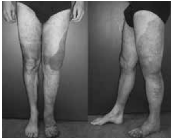
Combined capillary, venous, and lymphatic malformation, with hypotrophy in the length and hypertrophy in the girth.

diagnosed recurrent pulmonary embolism or pulmonary hypertension, 3,5,8-12 the exact mechanism underlying the hypercoagulability in vascular malformations remains unclear. However, blood stagnation within the distorted, enlarged venous blood vessels may lead to coagulation activation, 18 though this has never been studied in a large KTS group. 1