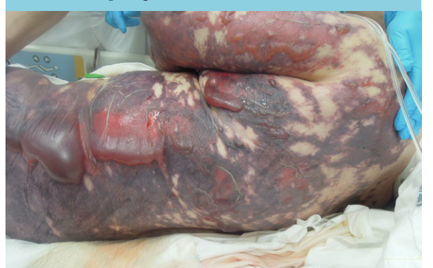
Figure 1. Haemorrhagic bullae and epidermolysis with Nikolsky's sign