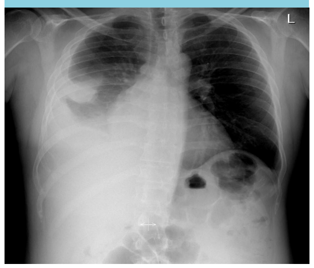
Figure 1. A chest X-ray shows a large right sided pleural effusion

On physical examination, the patient was afebrile, in general good condition and there was dullness over the right hemithorax extending up to the angle of the scapula, along with a corresponding reduction in the breath sounds. His chest X-ray showed massive right-sided pleural effusion ( figure 1 ) and a diagnostic and therapeutic thoracentesis was performed. Pleural fluid analysis revealed a haemorrhagic exudate with protein 49 g/l, glucose 7.1 mmol/l, lactate dehydrogenase 129 U/l and adenosine deaminase 23.6 U/l. Pleural fluid examination