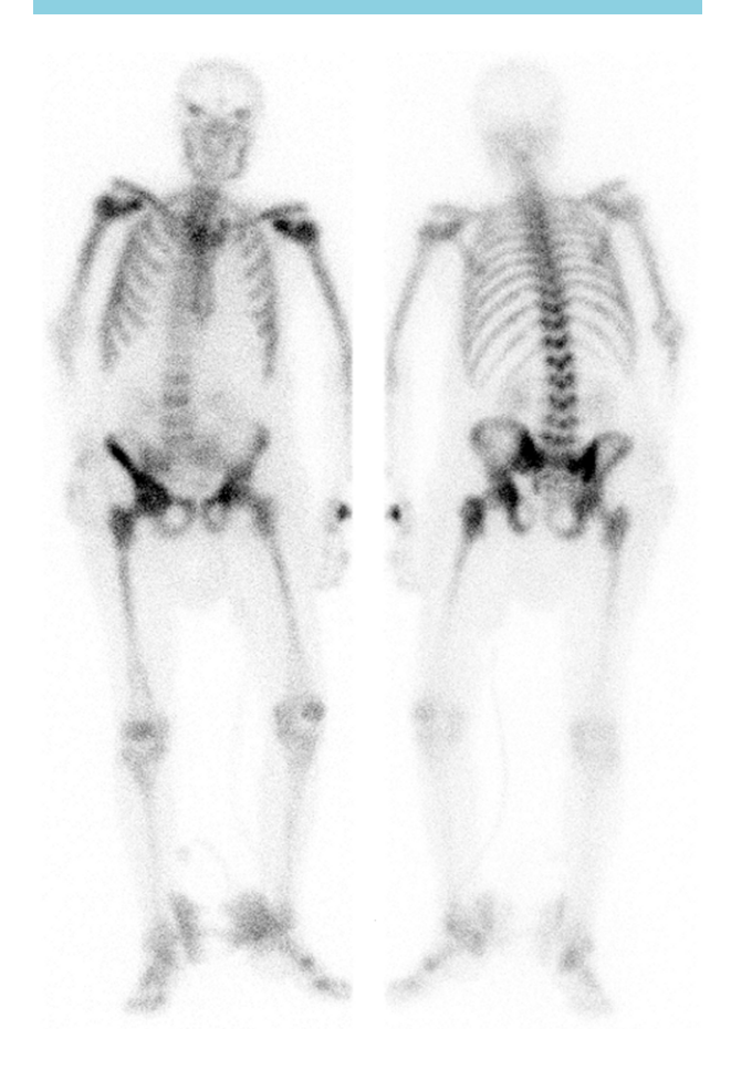
Figure 1. The patient's 99mTc bone scintigraphy showing a 'super bone scan'. This pattern of uniform symmetric increased bone uptake of tracer relative to soft tissue is not pathognomonic to extensive osteoblastic skeletal metastases and can also be seen in hyperparathyroidism, osteomalacia and myelofibrosis<sup>3</sup>

a serum albumin of 2 g/dl. Both were normal six months previously. The patient developed a positive Chvostek sign and prolonged QT interval. Serum phosphate, magnesium and creatine kinase were normal (table 1). The 25-hydroxyvitamin D level was 10.0 ng/ml (N > 50 ng/ml; < 8-10 identifies patients at high risk for osteomalacia). Intact parathyroid hormone (PTH) was increased to 319 pg/ml (N 15-68 pg/ml). Urinary 24-hour calcium level was 40 mg (N 100-300 mg). The prostatectomy pathology report arrived from another hospital, revealing that a markedly enlarged prostate (9 x 5.5 x 5 cm) resected four years ago had six foci of carcinoma involving the surgical margins, Gleason score 6. A bone scan was then normal and the patient declined treatment. A 99 mTc bone scintigraphy now revealed symmetric homogenous increased uptake in the skeleton, so called 'super scan' (figure 1), consistent with extensive bone metastases of prostate cancer.3 The current PSA returned markedly