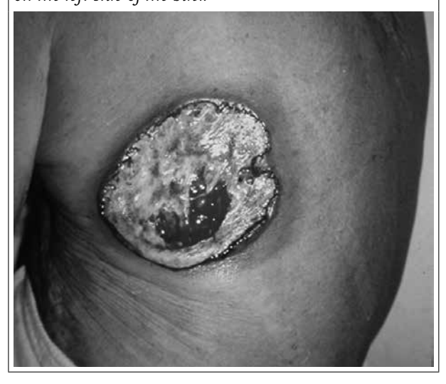
Figure 1. A large ulceration with elevated erythematousviolaceous borders and a necrotic and haemorrhagic base on the left side of the back