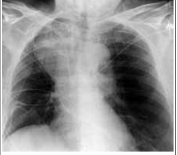
Dense opacity in the upper zone of the right lung, to some extent radiolucent with pleural lining.