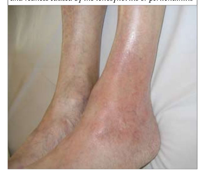
Figure 1. Left foot of the patient showing localised swelling and redness caused by the tenosynovitis or peritendinitis

A 65-year-old man complained of swelling and pain of his left foot since one day (figure 1). He had a history of rheumatoid arthritis, for which he was taking azathioprine and oral corticosteroids. He had not experienced symptoms in this foot before, neither had he received local corticosteroid therapy. At the time of presentation he did not complain of pain in the other joints. Physical examination of all joints was normal. However, on the dorsum of the left foot there was localised redness of the skin with a palpable fluctuating mass. Ultrasound examination showed signs of tenosynovitis or peritendinitis, without signs of arthritis. Needle aspiration of the palpable mass revealed a red-yellow substance. Microscopic examination of the aspirated fluid is shown in figure 2.