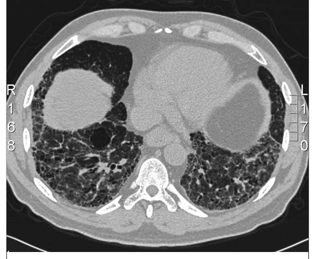
Figure 2. High-resolution computer tomography at the lung base in case 2

Marked reticular abnormalities with traction bronchiectasis and diffuse ground glass attenuation.