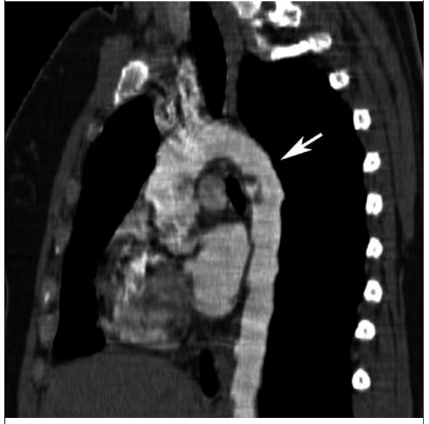
There is a nonenhancing intraluminal pedunculated mural mass in the proximal descending aorta.

Figure 2. Coronal 3D T1 weighted gradient-echo sequence (flash 3D) contrast-enhanced scan of the thoracic and upper abdominal aorta