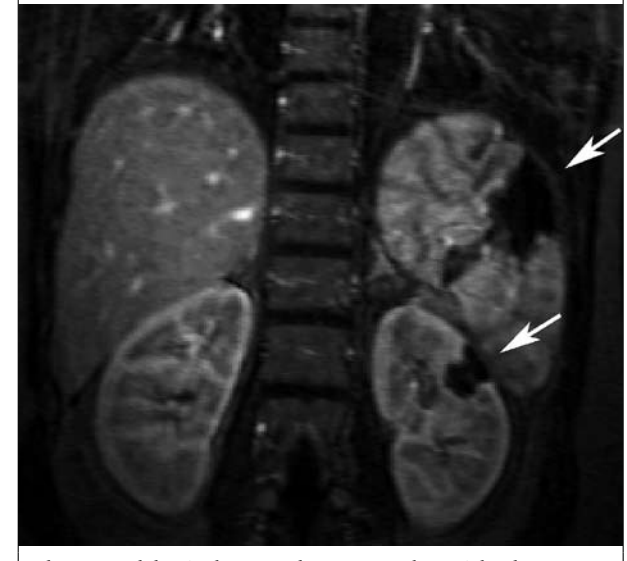
The upper abdominal organs show a normal arterial enhancement with the exception of two wedge-shaped areas of low signal intensity in the spleen and upper pool of the left kidney.

Figure 2. Coronal 3D T1 weighted gradient-echo sequence (flash 3D) contrast-enhanced scan of the thoracic and upper abdominal aorta