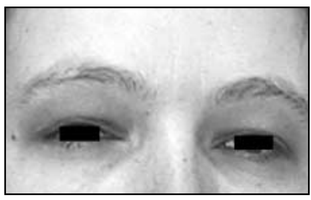
Figure 1 Wine red discolouration of the eyelids and the skin surrounding the eyes (left panel mother, right panel daughter)

A colour version of this photo quiz can be found on our website www.njmonline.nl.