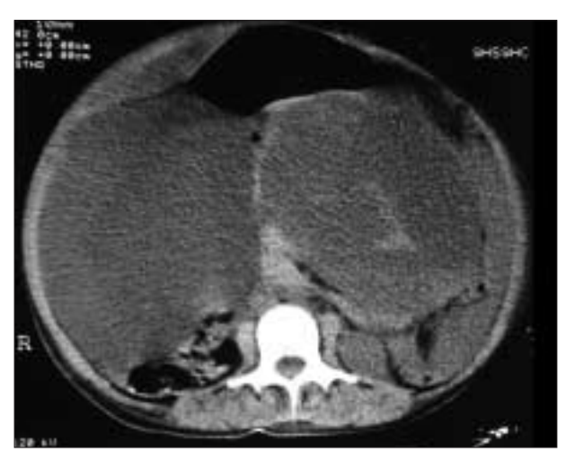
Figure 2 The abdominal CT of the patient, which was performed on the first day of hospitalisation, revealed two large cystic masses in the abdominal cavity

Necropsy was performed and macroscopic evaluation revealed extensive blue-coloured masses on her face, neck, chest, abdominal wall, major and minor labium, and limbs. Similar lesions were also observed on the pericardium, liver, renal hilus and bladder. Microscopically, these lesions were composed of large, blood-filled spaces with a thin endothelial lining and were consistent with cavernous haemangiomas. There were two cystic lesions measuring 25 and 35 cm in diameter in the abdomen, one filled with blood and the other with serous fluid (figure 3). Microscopic examination of these lesions, which were lined by attenuated endothelium, disclosed lymphangioma and there were small lymphoid aggregates in the stroma (figure 4). The gastrointestinal tract was examined carefully but no similar lesions were found. There were no pathological findings in any other organs such as brain, lungs, heart and spleen.