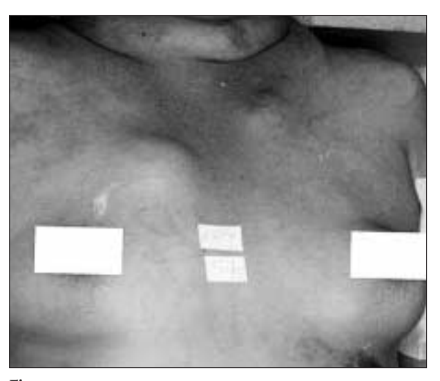
Figure 1 Widespread blue-coloured, soft cutaneous lesions on the trunk and neck

A 33-year-old woman was admitted to the intensive care unit with renal failure and severe anaemia. She had widespread blue-coloured lesions, which she had first noticed on her neck at the age of 13. She did not seek medical help for these lesions. She had two uneventful births and her children were healthy. There was no family history of similar lesions. Physical examination revealed a body temperature of 36°C, pulse rate 120 beats/min and regular, respiration rate 24/min and blood pressure 80/50 mmHg, supine. Her general condition was poor; she was pale and had multiple blue-coloured, soft, nodular lesions, ranging from 3 to 80 mm in size throughout her body (figure 1). Two soft painless masses