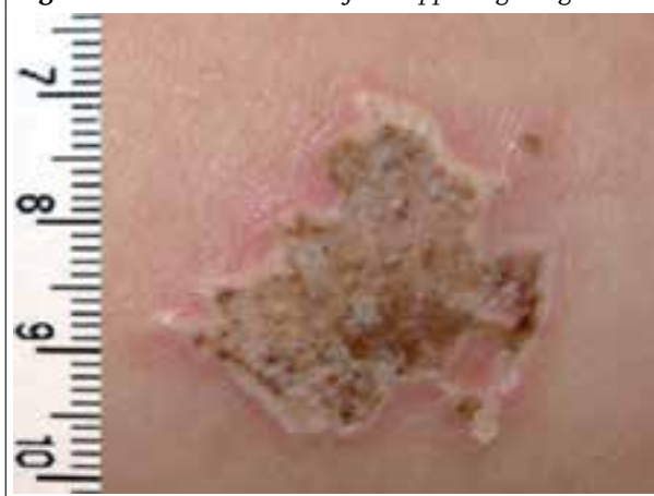
Figure 1. Cutaneous lesion of the upper right leg

Over 12 hours her condition stabilised and she gradually recovered. The skin lesions remained unchanged.